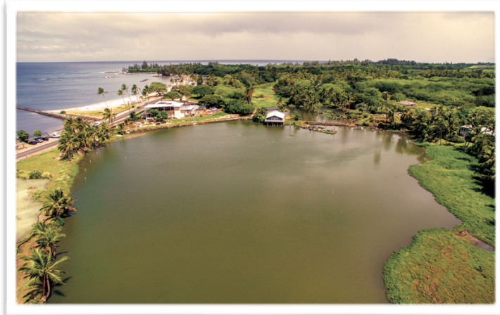
Loko Ea Fish Pond in Haleiwa

Your NSOC continues to work on preserving the view plane of Loko Ea Pond from Kamehameha Hwy. In case you missed it, the November issue of the Honolulu Magazine included Loko Ea Pond in it's "5 Most Endangered Historic Places in Hawaii" article.